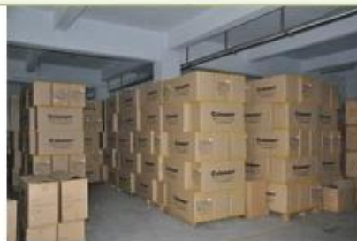
9. finished helmet

Welcome all our clients and partners to visit us to see our R&D center and factory facilities. At our show room, we carry a large selection of helmets for a wide range of sports applications, all at very attractive design! If you can't find what you are looking for, tell us, our friendly and courteous staff will be glad to help you with your helmets needs.