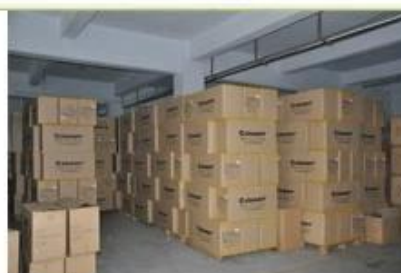
9. finished helmet

Welcome all our clients and partners to visit us to see our R&D center and factory facilities. At our show room, we carry a large selection of helmets for a wide range of sports applications, all at very attractive design! If you can't find what you are looking for, tell us, our friendly and courteous staff will be glad to help you with your helmets needs.