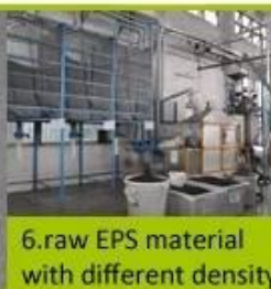
6. raw EPS material with different density