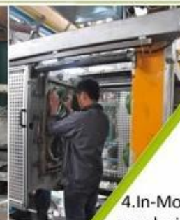
4. In-Mold producing process