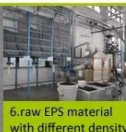
6. raw EPS material with different density