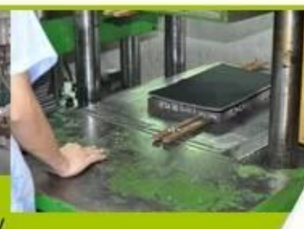
7. Inner padding Production