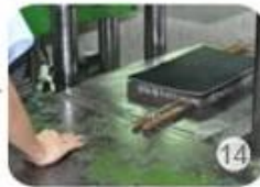
Inner padding production