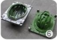
EPS in-mold tooling