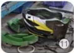
semi-finished In-mold helmet