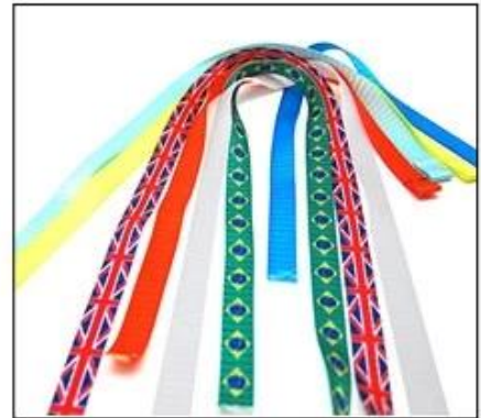
Available colored/patterned strap