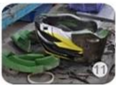
semi-finished In-mold helmet