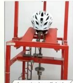
dynamic strength test