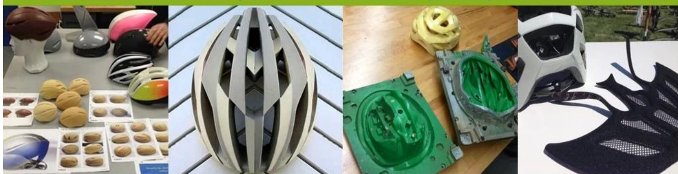
4. Final Production Stage