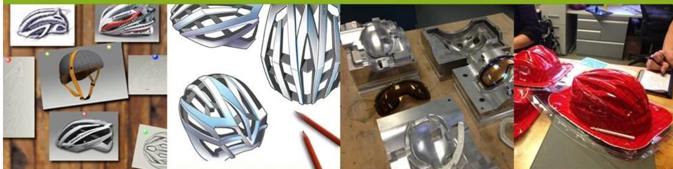
1. Trend predictions

Our in-house design facility coupled with our creative Account team enables us to create innovative helmets ideally suited to our clients target market - the company combines creativity and sourcing in a unique partnership to bring the best to any sports campaign.