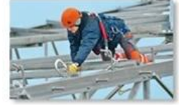
Work at height