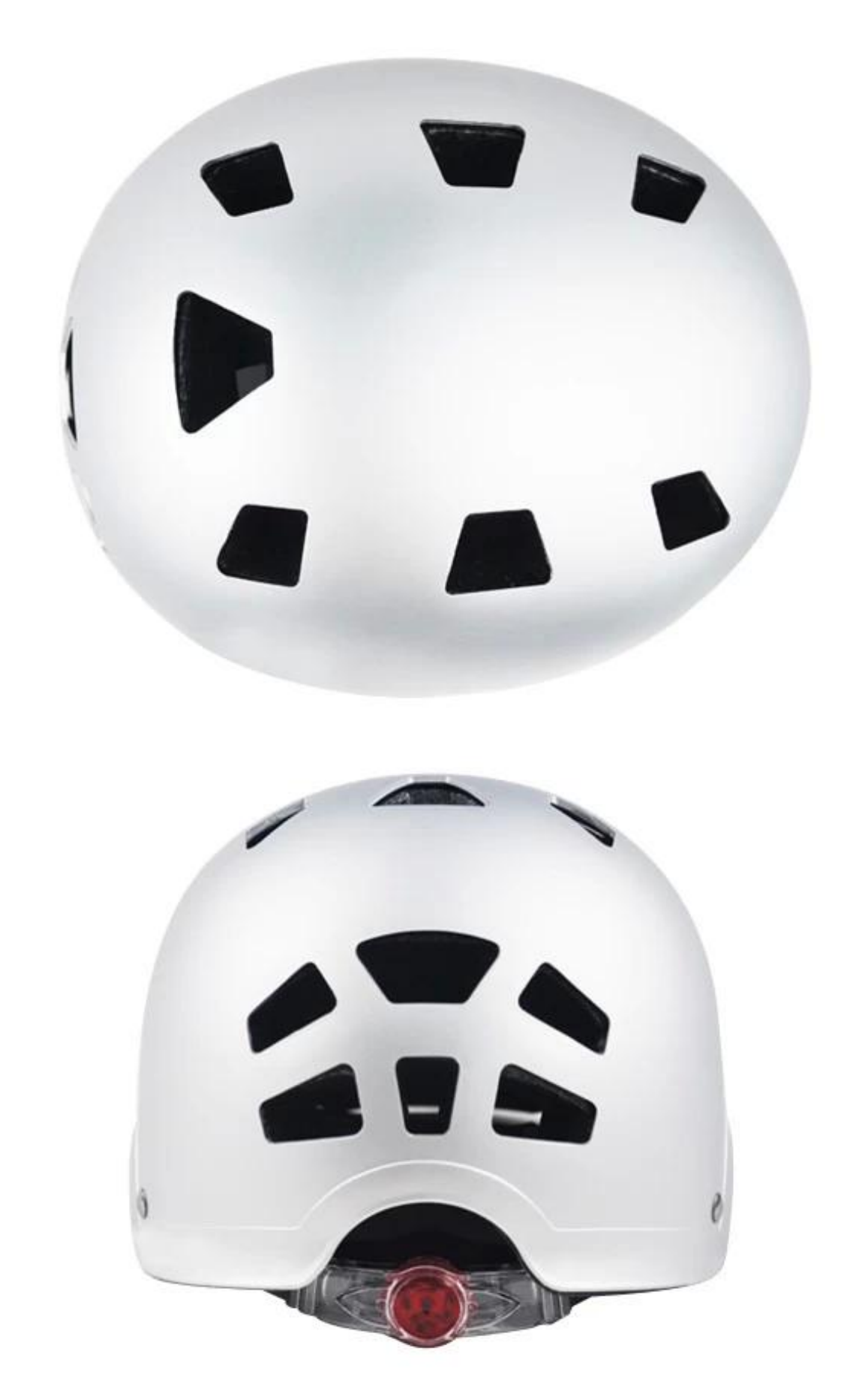
The head circumference knowledge of skate helmet: European Headform: