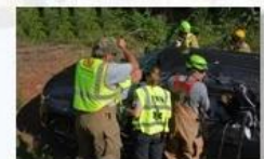
Rescue and evacuation