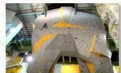
Big wall climbing