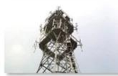
Mobile plant maintenance