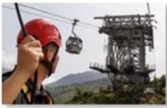
Cable car maintenance