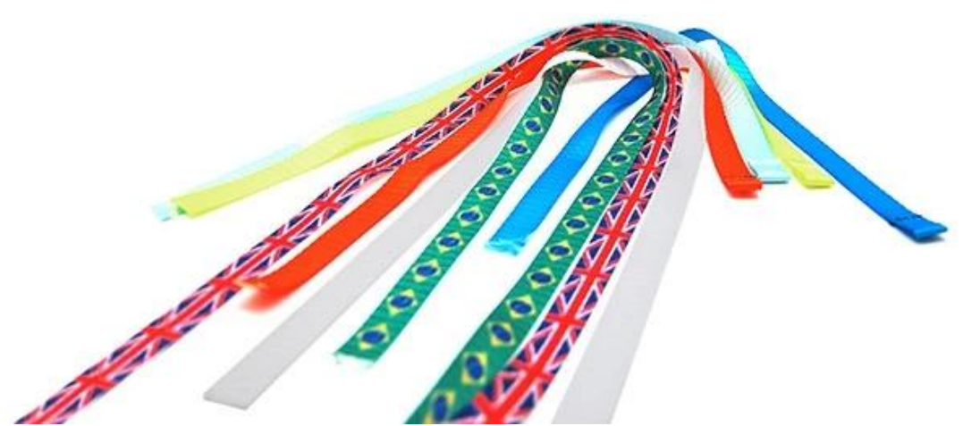
Tetoron straps are lighter, stronger and more breathable than a normal helmet strap. They also do not stick to the face as easily when temperatures begin to increase.