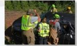
Rescue and evacuation