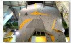
Big wall climbing