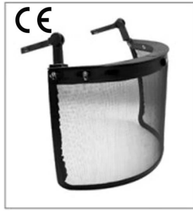
Iron mesh faceshield EN 1731