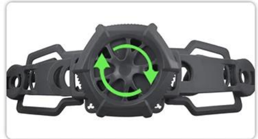
Rapid- Dial Ratchet Adjustment