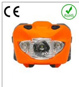
Versatile LED headlight 3A EN 61547:2009