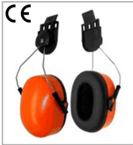
Noiseproof earmuff EN 352-3:2002