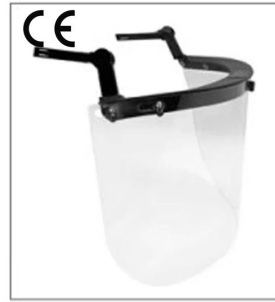
Clear faceshield EN 166 ANSI Z87.1