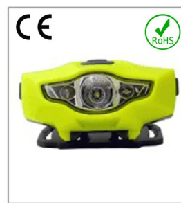
Versatile LED headlight 1A EN 55015: 2006

It can be applied to a variety of different scenarios