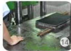
Inner padding production