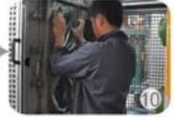
In-mold producing process