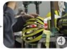
Trimming dug hole