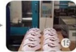
Plastic injection workshop