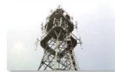
Mobile plant maintenance