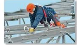
Work at height