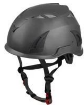
Grey pantone 432 C