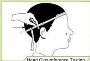
Head Circumference Testing