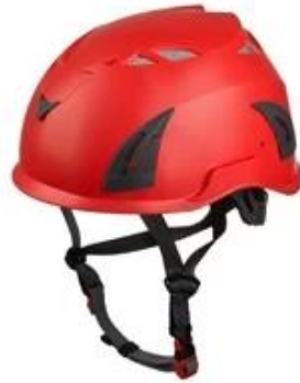
Red pantone 185 C