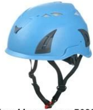
Navy blue pantone 7689 C