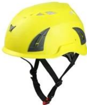
Yellow pantone 3965 U