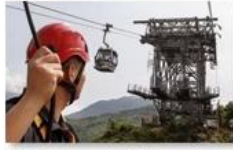
Cable car maintenance