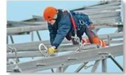
Work at height