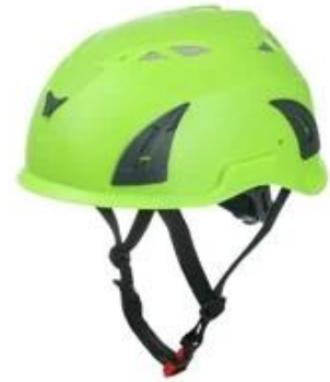
Lime green pantone 375 C