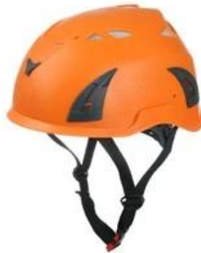
Orange pantone 165 C