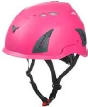
Pink pantone 806