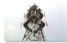
Mobile plant maintenance