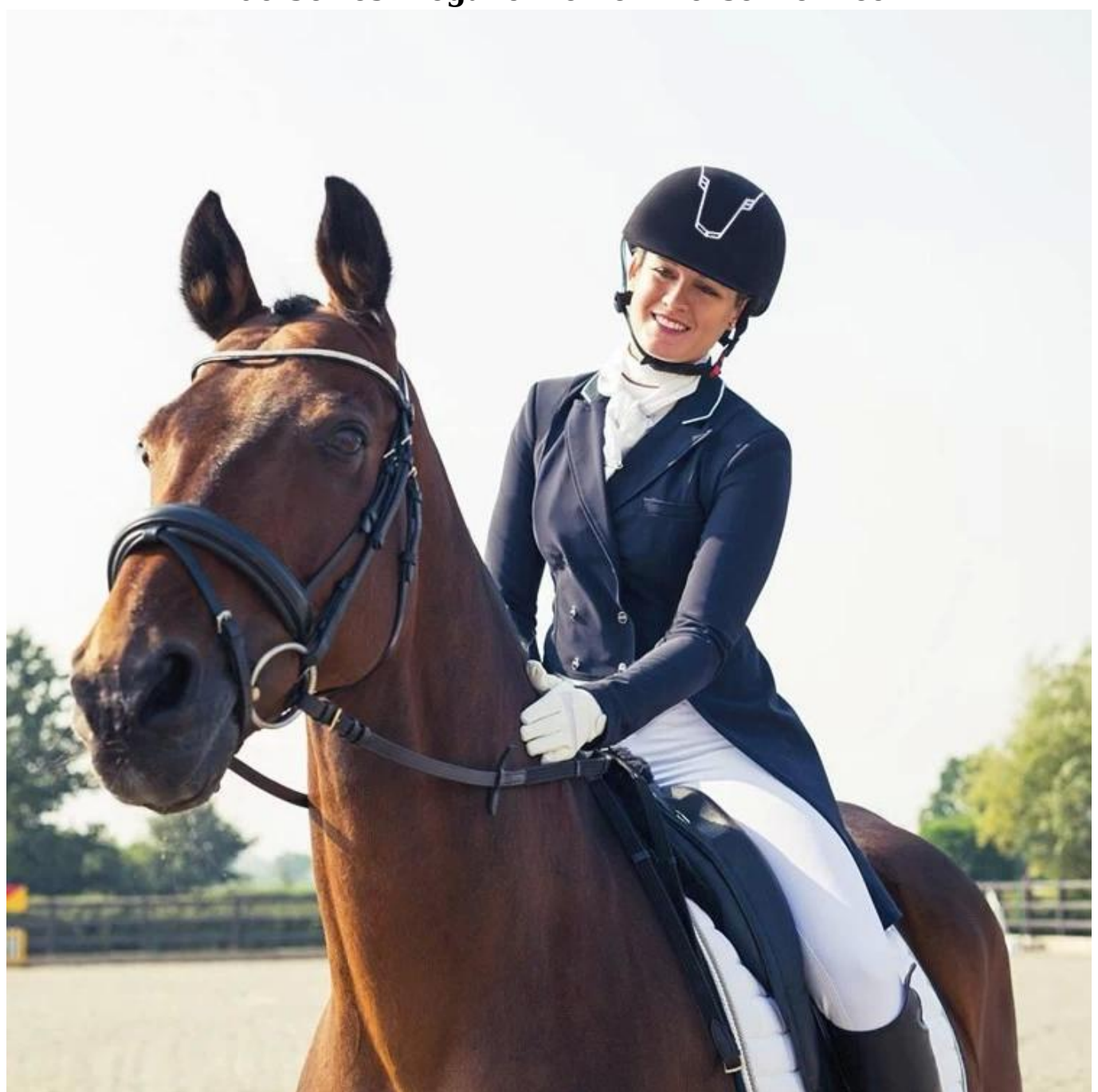
E06 Series Elegant Women Horse Helmet