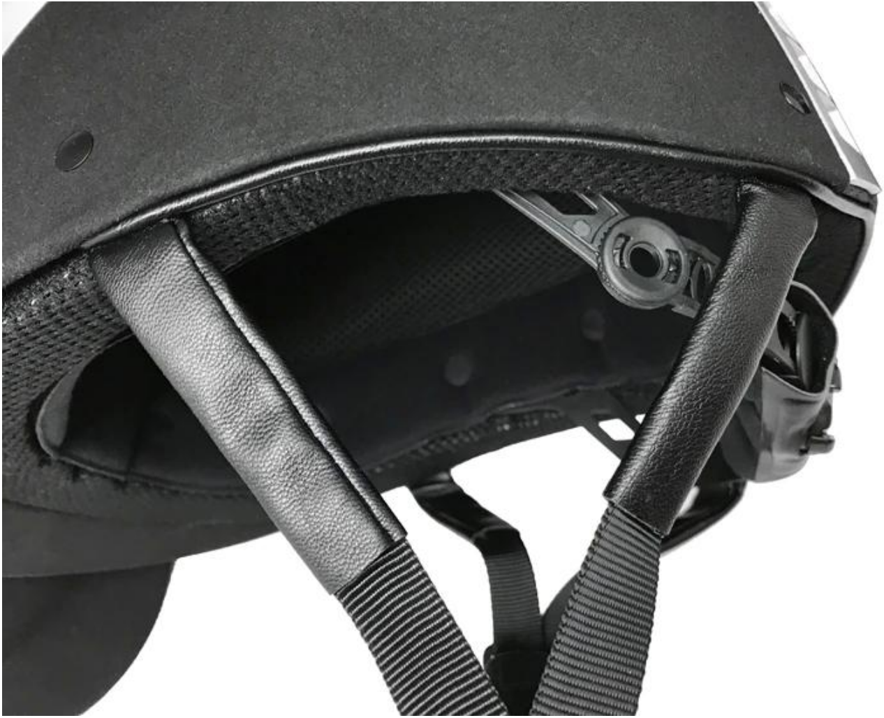
Anallergic eco-leather chinstrap

The anallergic eco-leather chinstrap provides exceptional comfort and helps prevent skin irritation, ensuring a pleasant wearing experience. It's also easy to clean, making maintenance effortless and hygiene simple to uphold