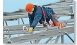
Work at height