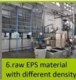
6. raw EPS material with different density