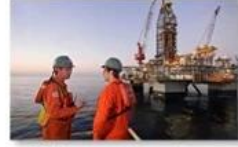
Offshore oil and gas