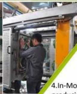
4. In-Mold producing process