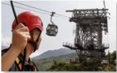
Cable car maintenance