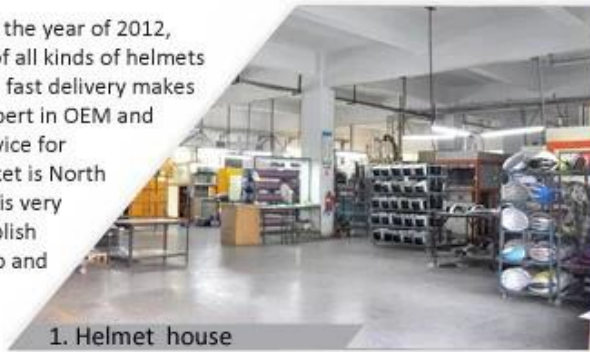
1. Helmet house

Shenzhen Aurora Sports Goods Co., LTD established in the year of 2012, more than 22 years experience. Expert in production of all kinds of helmets for different sports. Excellent quality, reasonable price, fast delivery makes us get very good reputation among our customers. Expert in OEM and ODM orders. Our skilled R&D team offers one stop service for throughout customers. 99% export and our main market is North America, European, Australia, Japan etc. Your enquiry is very welcomed and we will try our utmost to help you establish solid market. We are looking for long term relationship and get win win situation.