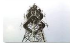
Mobile plant maintenance