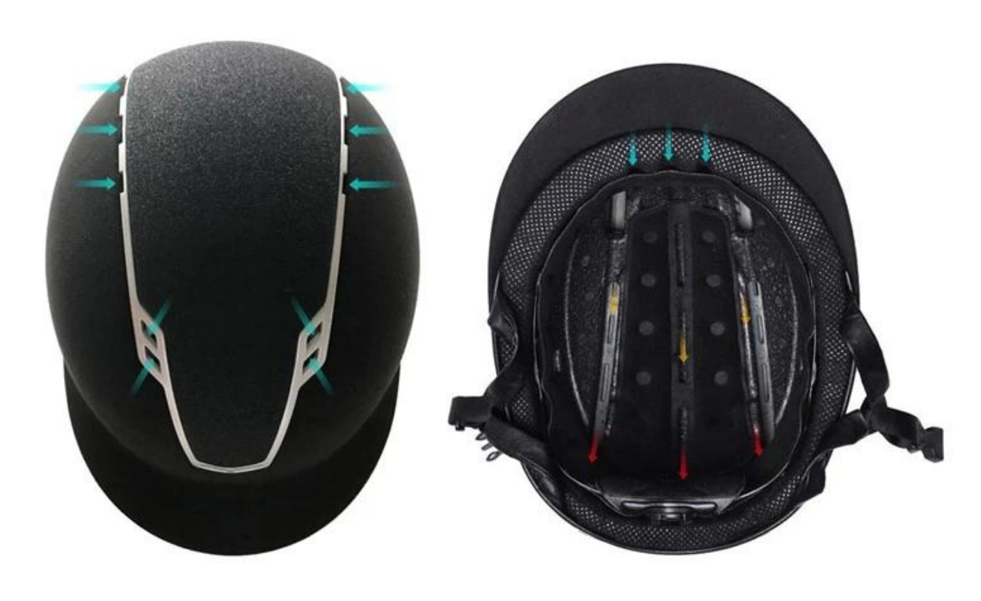
Elegant sparkle horse back riding equestrian helmets