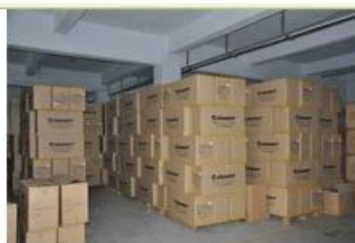
9. finished helmet

Welcome all our clients and partners to visit us to see our R&D center and factory facilities. At our show room, we carry a large selection of helmets for a wide range of sports applications, all at very attractive design! If you can't find what you are looking for, tell us, our friendly and courteous staff will be glad to help you with your helmets needs.