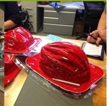
4. Final Production Stage