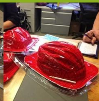
4. Final Production Stage