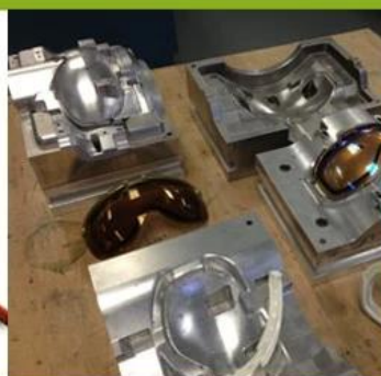
3. Development Stage