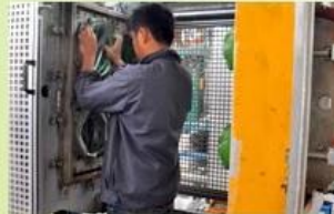
4. In-Mold producing process