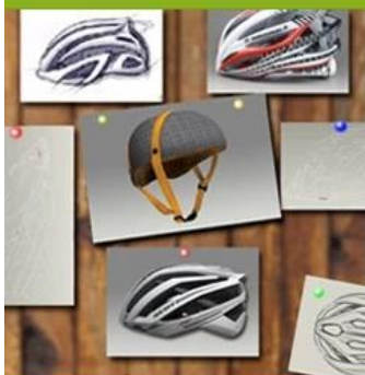
1. Trend predictions

Our in-house design facility coupled with our creative Account team enables us to create innovative helmets ideally suited to our clients target market - the company combines creativity and sourcing in a unique partnership to bring the best to any sports campaign.