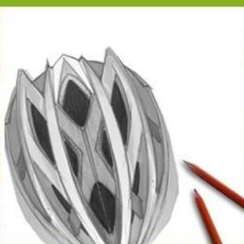
2. Conception Ideation