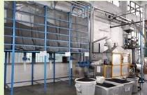
6. raw EPS material