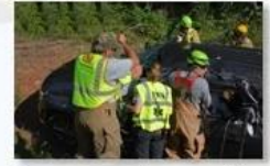
Rescue and evacuation