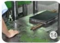
Inner padding production