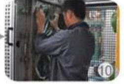
In-mold producing process