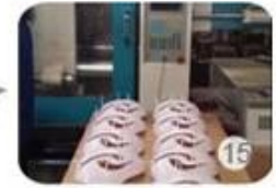
Plastic injection workshop