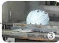
PC blister manufacture