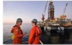
Offshore oil and gas