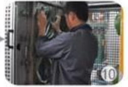
In-mold producing process