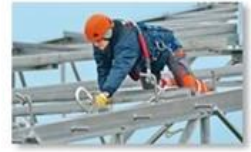
Work at height