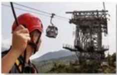
Cable car maintenance