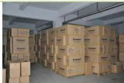
9. finished helmet

Welcome all our clients and partners to visit us to see our R&D center and factory facilities. At our show room, we carry a large selection of helmets for a wide range of sports applications, all at very attractive design! If you can't find what you are looking for, tell us, our friendly and courteous staff will be glad to help you with your helmets needs.