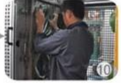
In-mold producing process