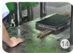
Inner padding production