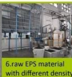
6. raw EPS material with different density