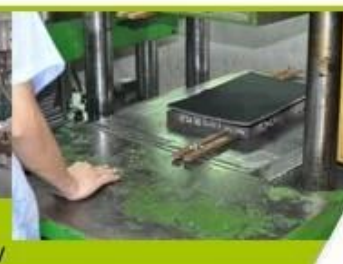
7. Inner padding Production