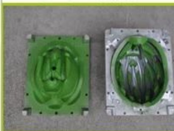
5. EPS In-mold tool