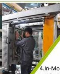
4. In-Mold producing process