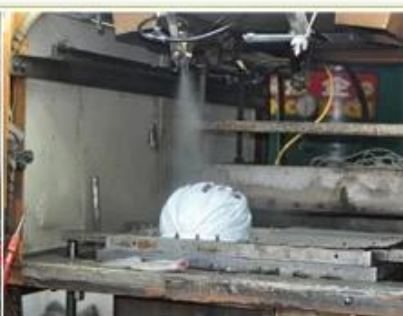
3. PC blister tooling