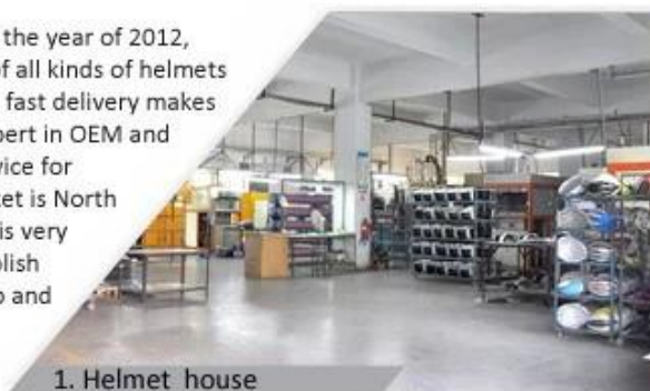
1. Helmet house

Shenzhen Aurora Sports Goods Co., LTD established in the year of 2012, more than 22 years experience. Expert in production of all kinds of helmets for different sports. Excellent quality, reasonable price, fast delivery makes us get very good reputation among our customers. Expert in OEM and ODM orders. Our skilled R&D team offers one stop service for throughout customers. 99% export and our main market is North America, European, Australia, Japan etc. Your enquiry is very welcomed and we will try our utmost to help you establish solid market. We are looking for long term relationship and get win win situation.