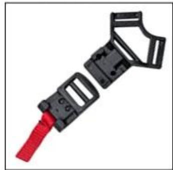
Fidlock magnetic buckle