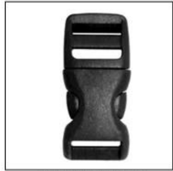
Traditional helmet buckle