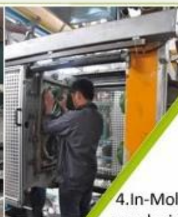
4. In-Mold producing process