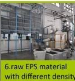
6. raw EPS material with different density