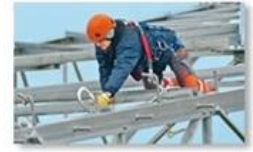
Work at height