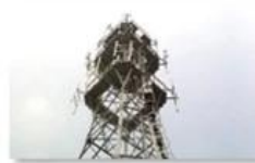
Mobile plant maintenance