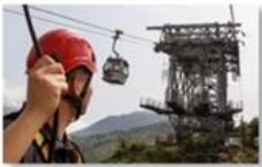
Cable car maintenance