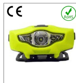
Versatile LED headlight 1A EN 55015: 2006