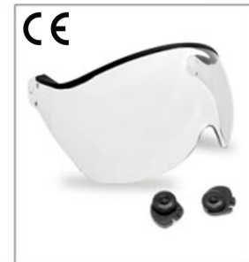
New deve loped clear visor EN266