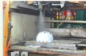
3. PC blister tooling