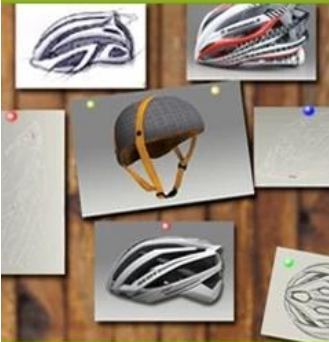
1. Trend predictions

Our in-house design facility coupled with our creative Account team enables us to create innovative helmets ideally suited to our clients target market - the company combines creativity and sourcing in a unique partnership to bring the best to any sports campaign.