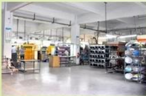
1. Helmet house

established in the year of 2012, more than 22 years experience. Expert in production of all kinds of helmets for different sports. Excellent quality, reasonable price, fast delivery makes us get very good reputation among our customers. Expert in OEM and ODM orders. Our skilled R&D team offers one stop service for throughout customers. 99% export and our main market is North America, European, Australia, Japan etc. Your enquiry is very welcomed and we will try our utmost to help you establish solid market. We are looking for long term relationship and get win win situation.