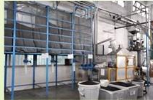
6. raw EPS material