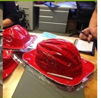
4. Final Production Stage