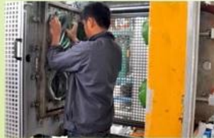
4. In-Mold producing process