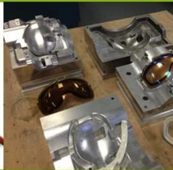
3. Development Stage