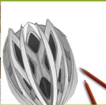
2. Conception Ideation