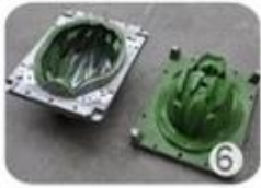
EPS in-mold tooling