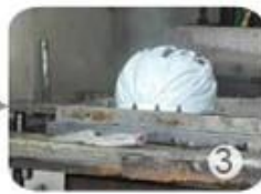
PC blister manufacture