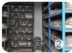
PC blister tooling