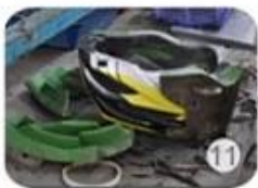
semi-finished In-mold helmet