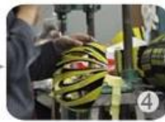
Trimming dug hole