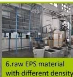
6. raw EPS material with different density