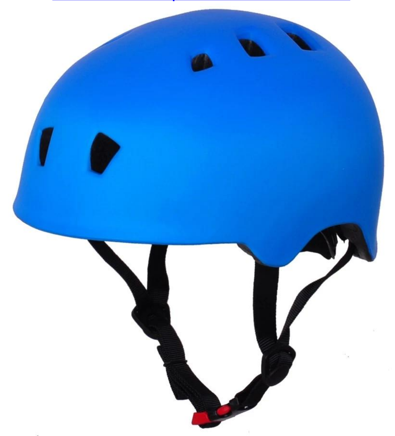
New Adults Skateboard protec skate board helmet AU-K001