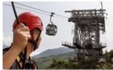
Cable car maintenance