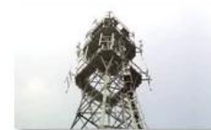
Mobile plant maintenance