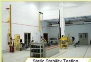
Static Stability Testing

Every manufacturing steps at AURORA follows adhere to strict quality parameters and focus on quality throughout the each stagesinvolved. All raw material and semi finished goods at AURORA pass strict quality control. The finished product, helmets at Aurora is then tested and qualified to export to the world.