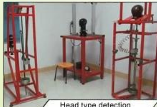
Head type detection