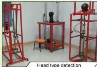
Head type detection