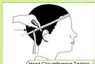
Head Circumference Testing