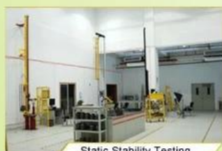
Static Stability Testing

Every manufacturing steps at AURORA follows adhere to strict quality parameters and focus on quality throughout the each stagesinvolved. All raw material and semi finished goods at AURORA pass strict quality control. The finished product, helmets at Aurora is then tested and qualified to export to the world.