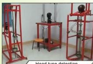
Head type detection