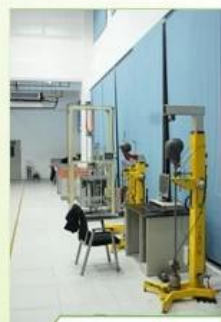
Shock Absorbing Capacity