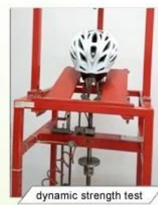
dynamic strength test