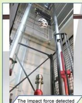
The Impact force detected