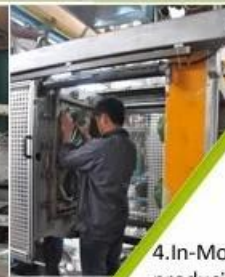
4. In-Mold producing process