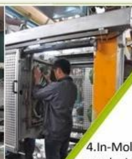
4. In-Mold producing process