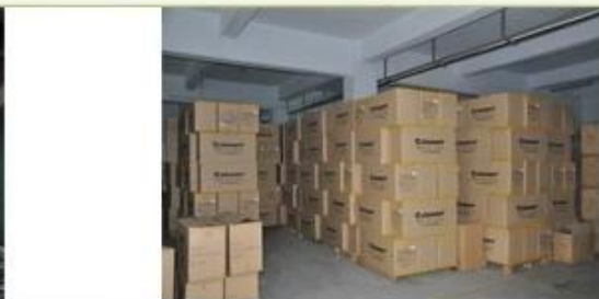
9. finished helmet