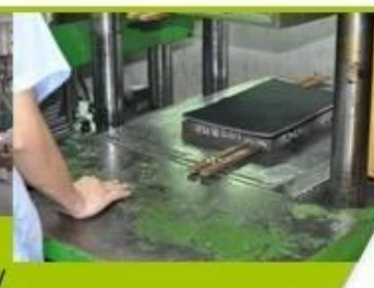
7. Inner padding Production