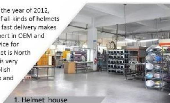
1. Helmet house

Shenzhen Aurora Sports Goods Co., LTD established in the year of 2012, more than 22 years experience. Expert in production of all kinds of helmets for different sports. Excellent quality, reasonable price, fast delivery makes us get very good reputation among our customers. Expert in OEM and ODM orders. Our skilled R&D team offers one stop service for throughout customers. 99% export and our main market is North America, European, Australia, Japan etc. Your enquiry is very welcomed and we will try our utmost to help you establish solid market. We are looking for long term relationship and get win win situation.