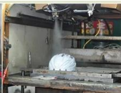
3. PC blister tooling