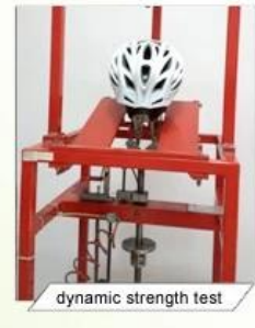
dynamic strength test