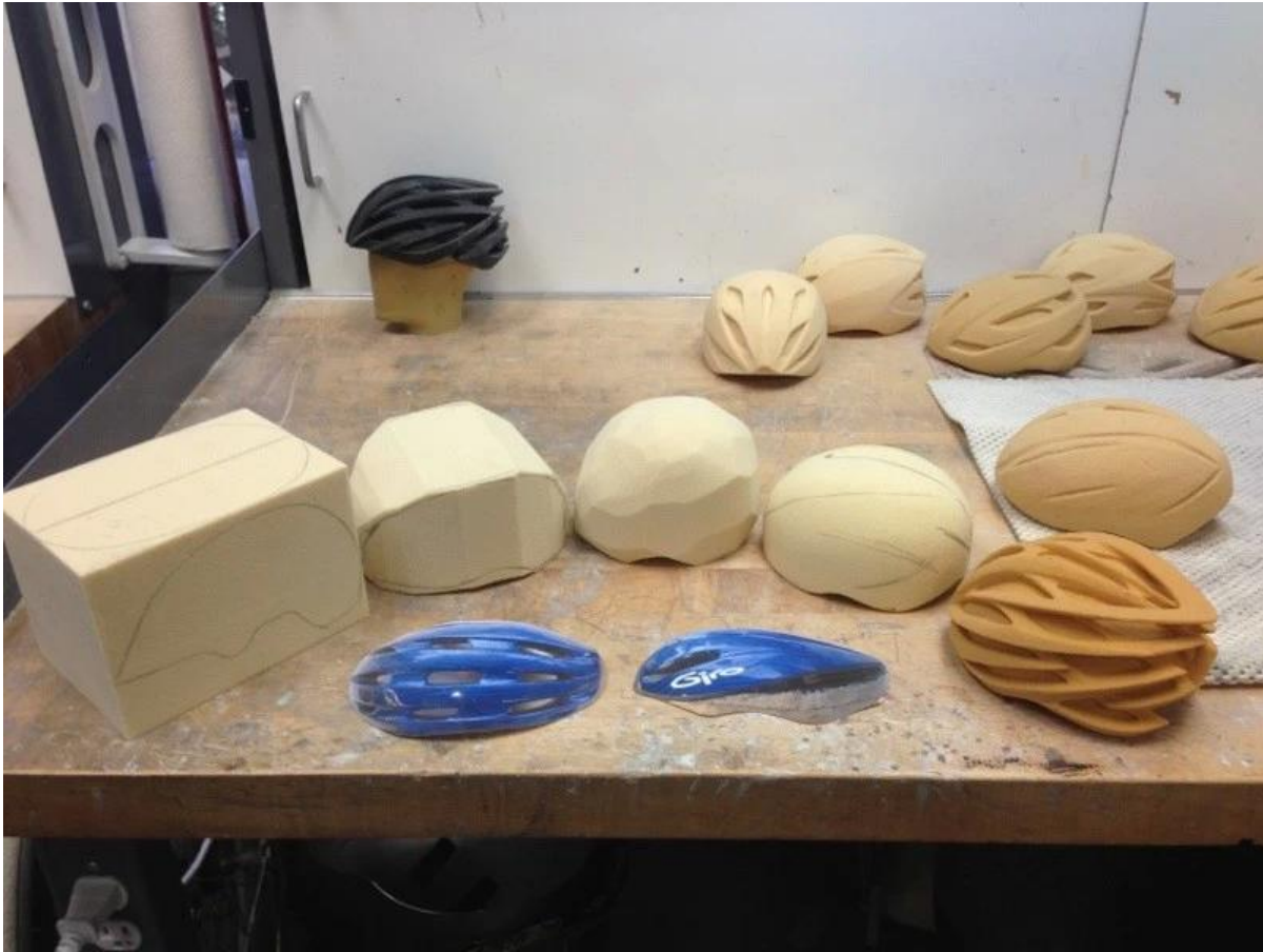
Open PC mold