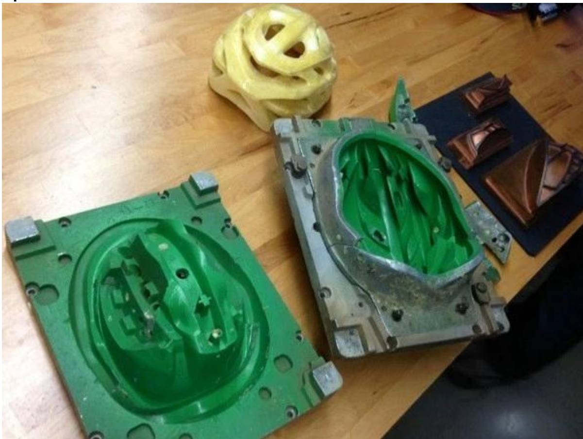
CNC master & pads