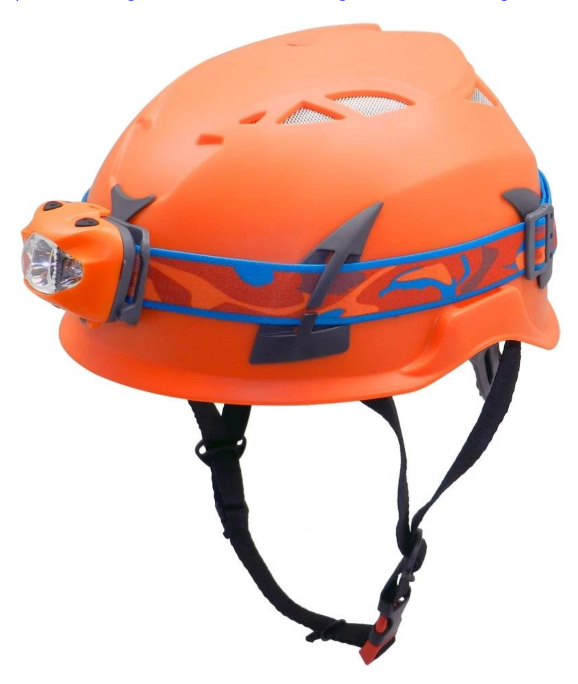
Sport Climbing Helmet With Streamlight Fire Helmet Light AU-M02