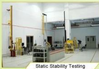
Static Stability Testing

Every manufacturing steps at AURORA follows adhere to strict quality parameters and focus on quality throughout the each stagesinvolved. All raw material and semi finished goods at AURORA pass strict quality control. The finished product, helmets at Aurora is then tested and qualified to export to the world.