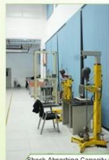
Shock Absorbing Capacity