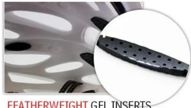
FEATHERWEIGHT GEL INSERTS