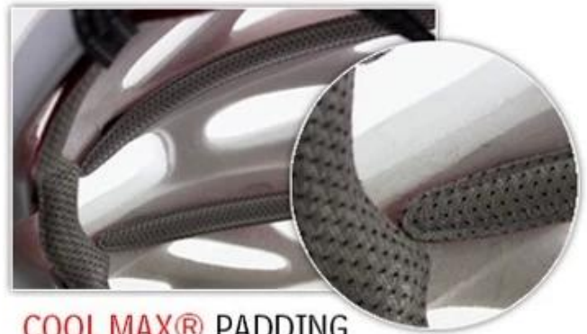
COOL MAX® PADDING