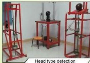
Head type detection