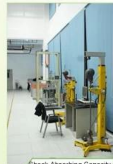
Shock Absorbing Capacity