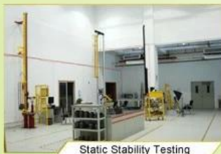
Static Stability Testing

Every manufacturing steps at AURORA follows adhere to strict quality parameters and focus on quality throughout the each stagesinvolved. All raw material and semi finished goods at AURORA pass strict quality control. The finished product, helmets at Aurora is then tested and qualified to export to the world.